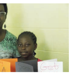
Student sells her custom greeting cards at