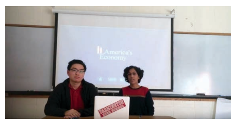
Ozark Junior High School, AR