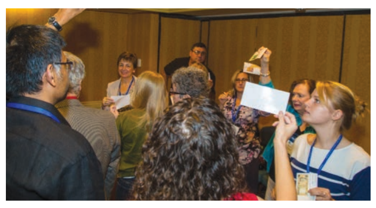
Teachers actively engaging in a conference session