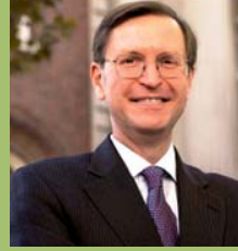
Dean and Russell L. Carson Professor of Finance and Economics Columbia Business School