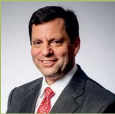
Chairman and CEO First Data