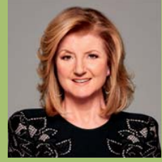
Founder of The Huffington Post and Founder and CEO of Thrive Global

Honorees will participate in a fireside chat with